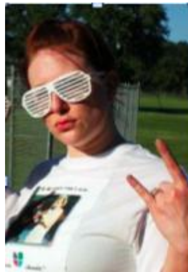
(from Battle 2010)

Put on your game face and prepare to fight for the title... and bragging rights for your station for the year to come! Battle of the Media Stars is such a memorable ongoing AWM Austin event. Team members work together to establish a captain, to come up with their theme and costumes and to decide who will be participating in which event. The competition itself also serves as a great team-building and networking opportunity, in addition to being a TON of fun (doesn't everyone love seeing coworkers get horribly disoriented during dizzy bat, or watching entire teams plummet in the tug-o-war?!).